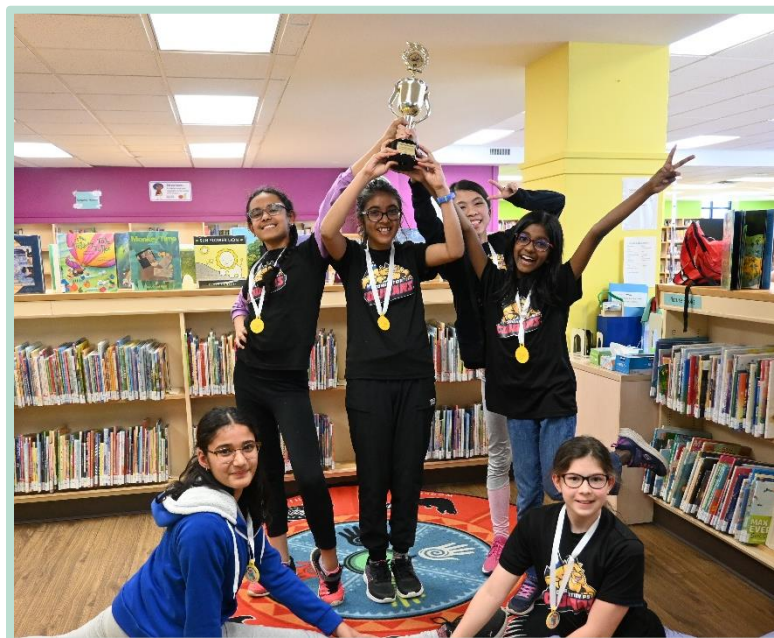
2024 Regional Junior Champions, Coronation Public School (Oshawa)